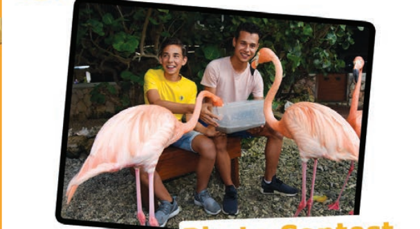
Photo Contest The winner gets: A VIP day for 2 persons at Curaçao Sea Aquarium including its amazing experiences What is your favorite Curaçao Sea Aquarium Photo? Post it on Facebook and don't forget to tag @curacaoseaaquarium 📍 Sea Aquarium Park, Bapor Kibra z/n 📧 info@csapark.com / 🌐 www.csapark.com